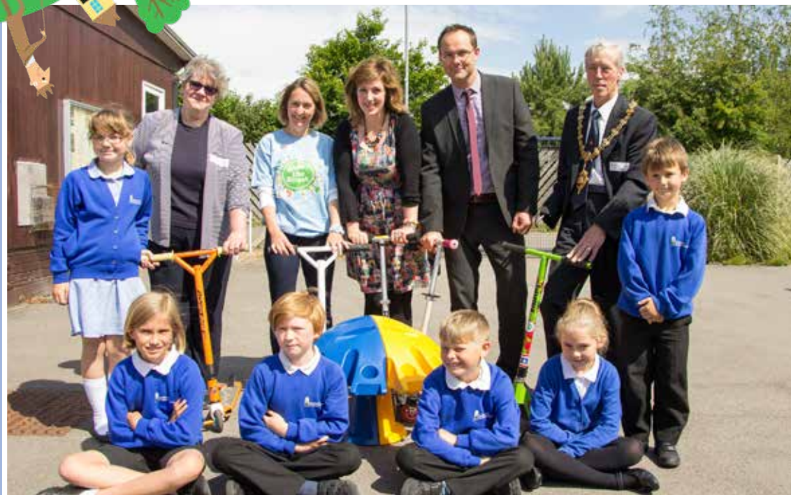
Southbroom St James Academy who won the highest points achieved in Beat the Street

In Southern Wiltshire a volunteer-led footpath project was developed to improve paths and access and provide opportunities for outdoor recreation. As a result over 60 kissing gates have been installed across the area, amounting to well over 600 volunteer hours. There has been continuing support for this group and investment in a volunteer coordinator.