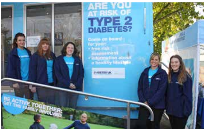
Wiltshire health trainers and Diabetes UK volunteers outside the mobile Type 2 Diabetes risk assessment centre

We visited Trowbridge, Melksham, Chippenham, Salisbury and Devizes and our team assessed 454 people to find out their risk of developing diabetes. They referred 268 people who were at moderate or high risk to their GP. There was a higher than average referral rate from Trowbridge, Melksham, Devizes and Salisbury which indicates we are targeting the right areas. Everyone who spoke to the team received support from a specialist dietician and the Wiltshire health trainers, with the aim of reducing their risk of Type 2 Diabetes.